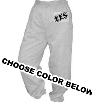
Sweat Pants with elastic waist and cuffs.