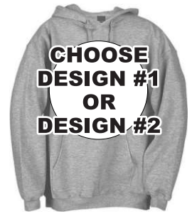
Grey Hooded Pullover with pouch pocket.