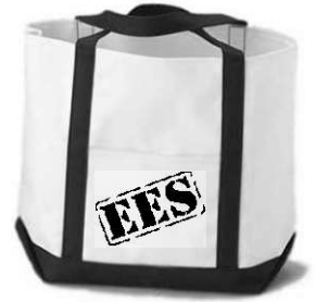
23"x15"x5" Natural Canvas Tote Bag with Black carrying handles and outside pocket.

ALL PRODUCTS DO NOT RUN THE SAME SIZE, PLEASE ORDER A SIZE LARGER