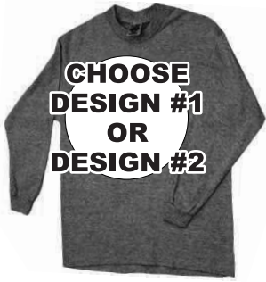
Purple Long Sleeve Tee with crew neck.