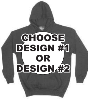
Purple Hooded Pullover with pouch pocket.