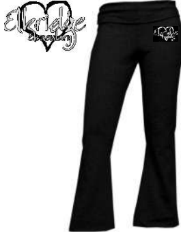
Girls Black Yoga Pants with fold down waist and flare leg. (cotton/spandex)