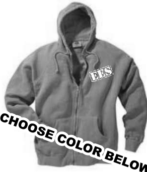
Zippered Hood Sweat with pockets.