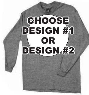
Grey Long Sleeve Tee with crew neck.