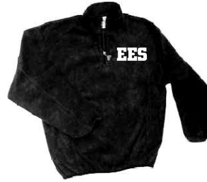
"Custom Embroidered" Chill Fleece Pullover with quarter zipper and pockets.