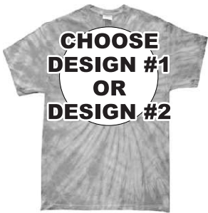
Royal Blue "Spider Design" Tie-Dye Tee